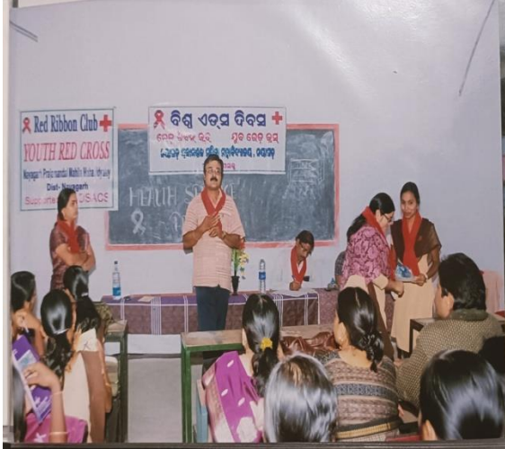
Observance of World AIDS Day in 2015