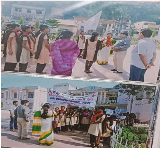
YRC with district administration on AIDS day.