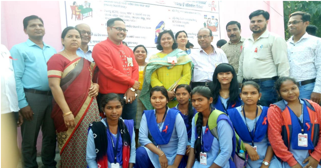
YRC volunteers with district administration on AIDS day2019