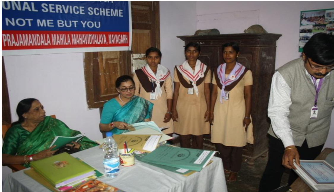
NAAC peer team visit to YRC on 06.12.2016