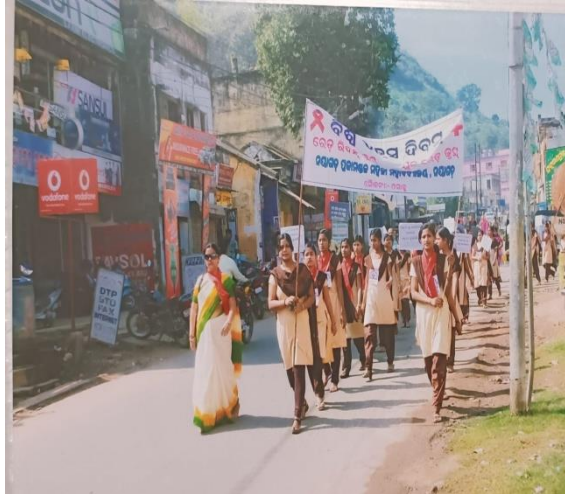
Rally on AIDS day in 2016