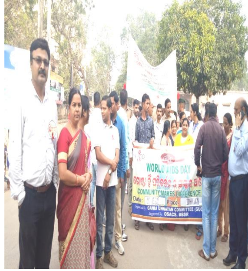
Rally on AIDS day 2019