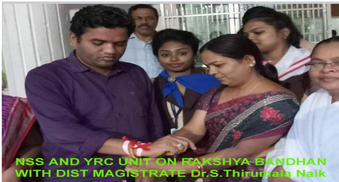
Raksha Bandhan programme : red ribbon as Rakhi which spreads the awareness about HIV/AIDS on 25th August 2018